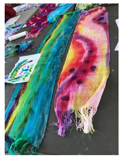
Some of our scarves, prior to pulling the supplemental threads.