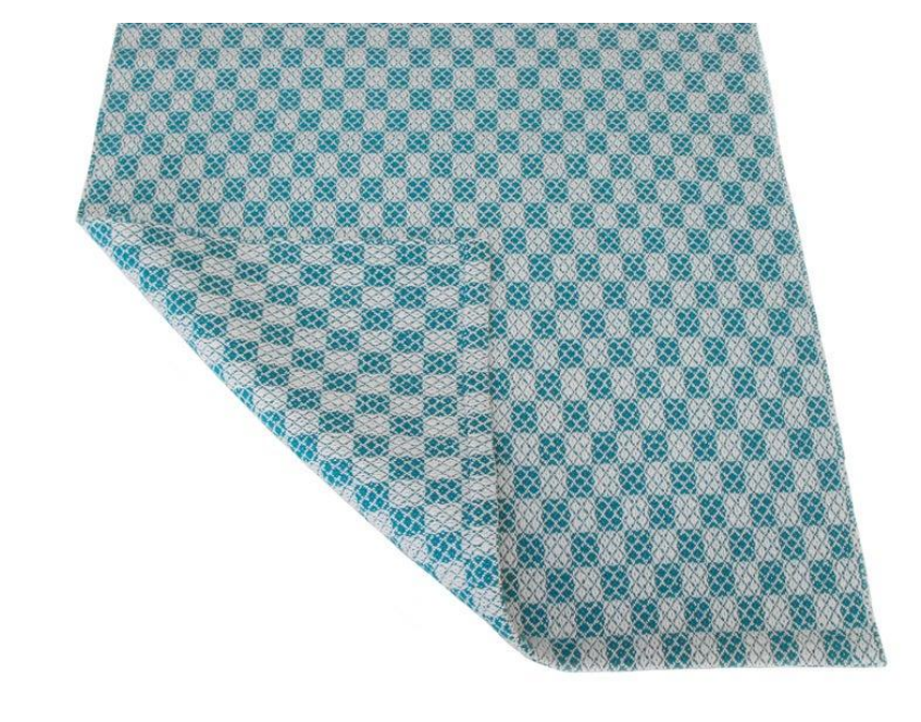
Illustration of 8 Shaft Korndrall Towel