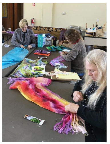
Pulling supplemental threads: very serious business!