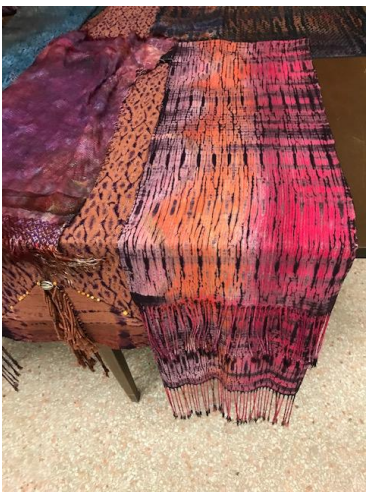
Some of Dottie's Samples