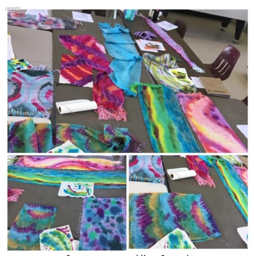
Scarves, scarves, and More Scarves!