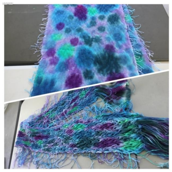
Top-Before Pulling Supplemental Warps Bottom-After Pulling