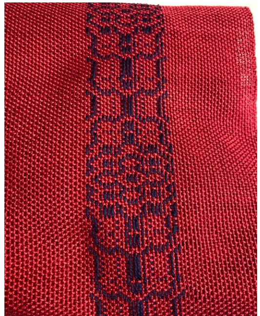
The picture on the left shows the whole sampler; on the right is a close-up.

Elizabeth's message was: I am attaching 2 photos, one before and one after wet finishing which also shows front and back. Thanks again for opening up the class to us outsiders!