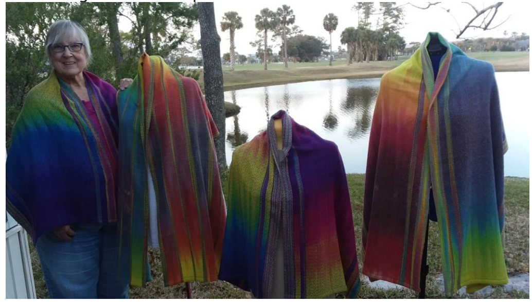
More pictures of Rudell's Hugs are on the next page!