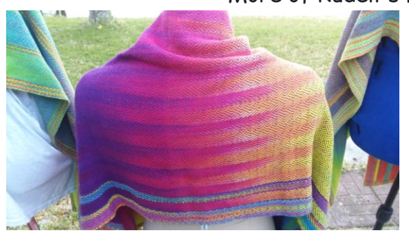
More of Rudell's Hugs!