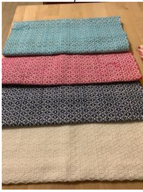
Two of these were to become Guild Anniversary Towels, but they became emergency Christmas presents instead.