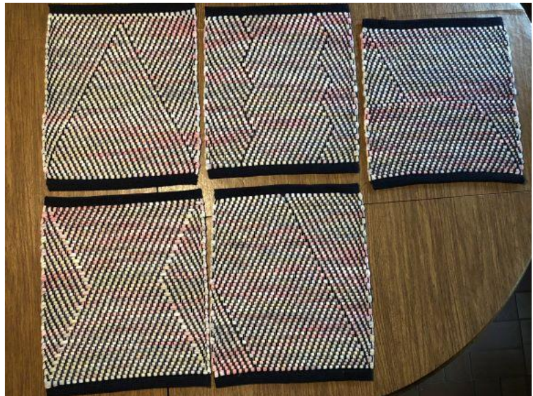
8/8 cotton warp with fabric strips as weft. Every other weft required 1 or 2 instances of bringing the shuttle up at some point, changing the shed, and continuing across.