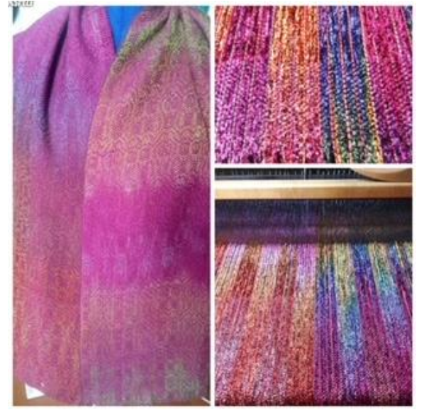
Moebius Scarf on the left; chenille warp with 8/2 tencel weft will become a throw that is 40"X60" when two panels are sewn together.