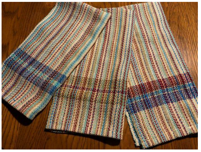
Six 5/2 cotton kitchen towels (from the same warp)