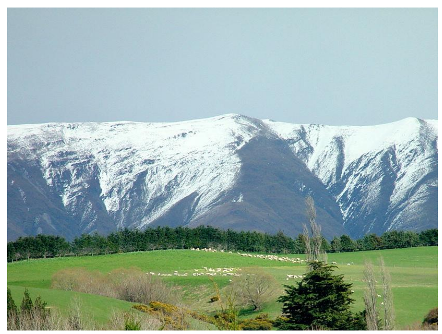
The white "dots" in the center of this picture are sheep.