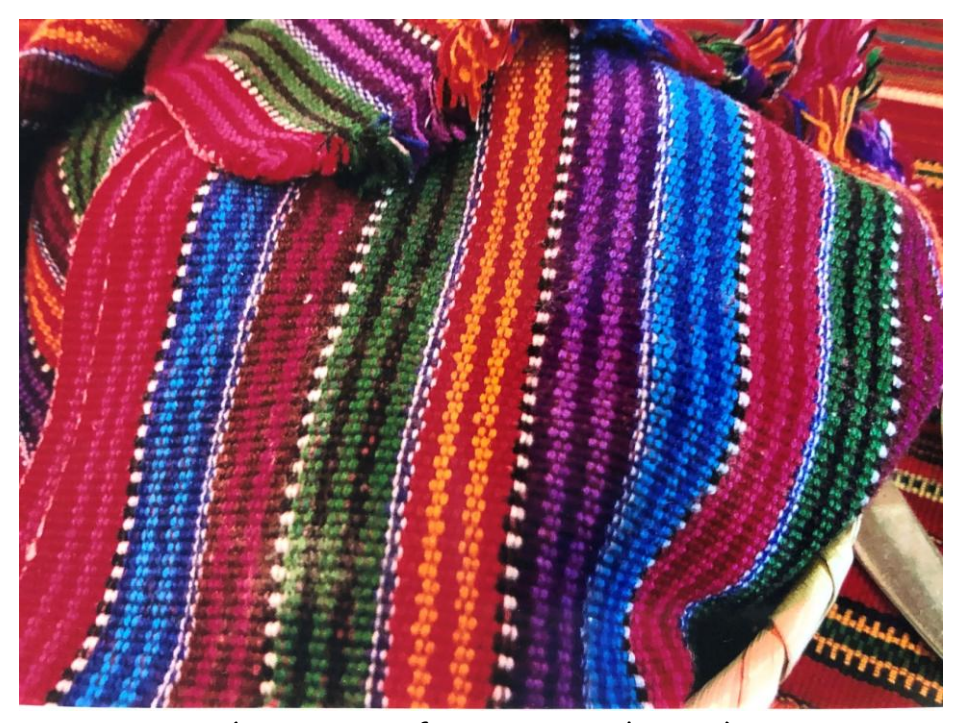
(Inspiration from Guatemala trip.)