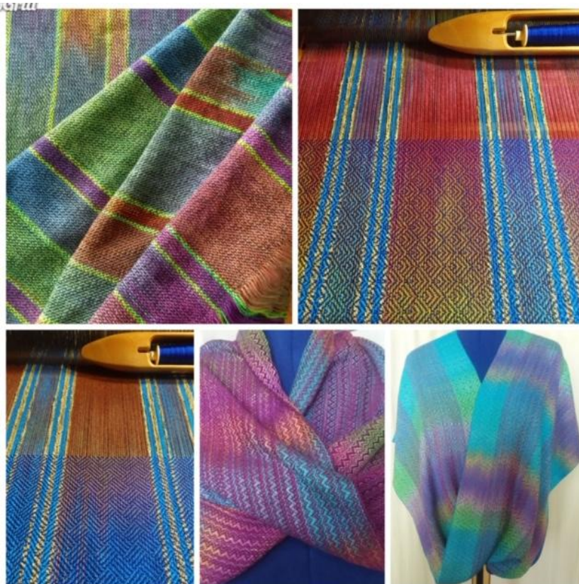
Rudell Kopp's Projects