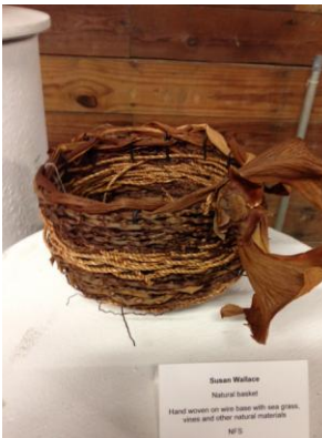
Susan Wallace Natural basket Hand woven on wire base with oak, pine, willow and other natural materials MS 5