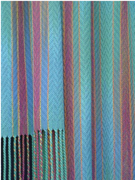
More stunning examples of woven scarves by Lynette