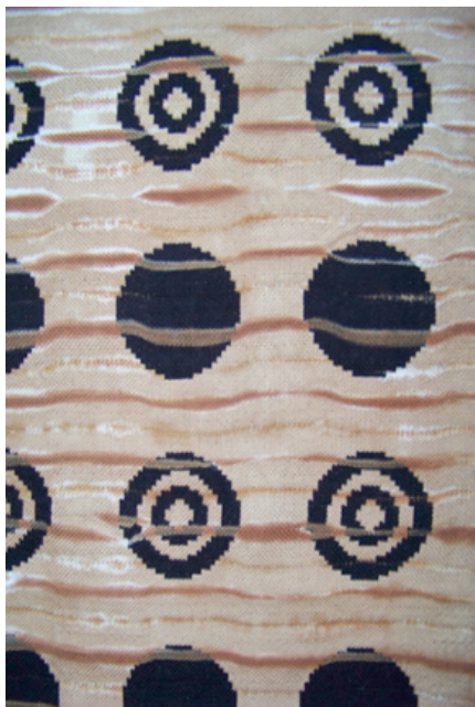
Kay Faulkner, Instructor and Exhibit Juror for Convergence® 2012

HGA's Convergence® conference is an outstanding conference for everyone who loves and works in fiber. The Convergence® conference features special lectures, workshops and seminars, exhibits, tours, special events, and a commercial vendor hall full of fibers, fiber-related equipment, and an artist market.