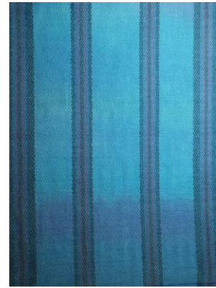
#1 The cotton v-shawl with a Blazing Shuttles dyed Ocean warp & weft of thick & thin cotton woven in straight twill on my 4-S Baby Wolf. #2 The cotton hand towel woven in a reverse twill with the end of the Ocean warp.