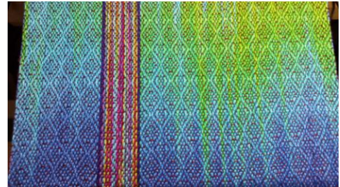
#3 Scarves woven with a Blazing Shuttles dyed 6/2 tencel dyed Confetti warp on my 8-S Baby Wolf. I shifted the colors in the warp & added an asymmetrical stripe using a Blazing Shuttles dyed tencel skein wound into a warp outlined by a dark purple. The threading was a point twill but both scarves had a different tie-up & treadling. One was woven with Adobe 8/2 tencel & the other in Dark Teal 8/2 tencel. Both are off the loom now & I will be wet finishing them today. I already have my next 2 projects planned! :-)