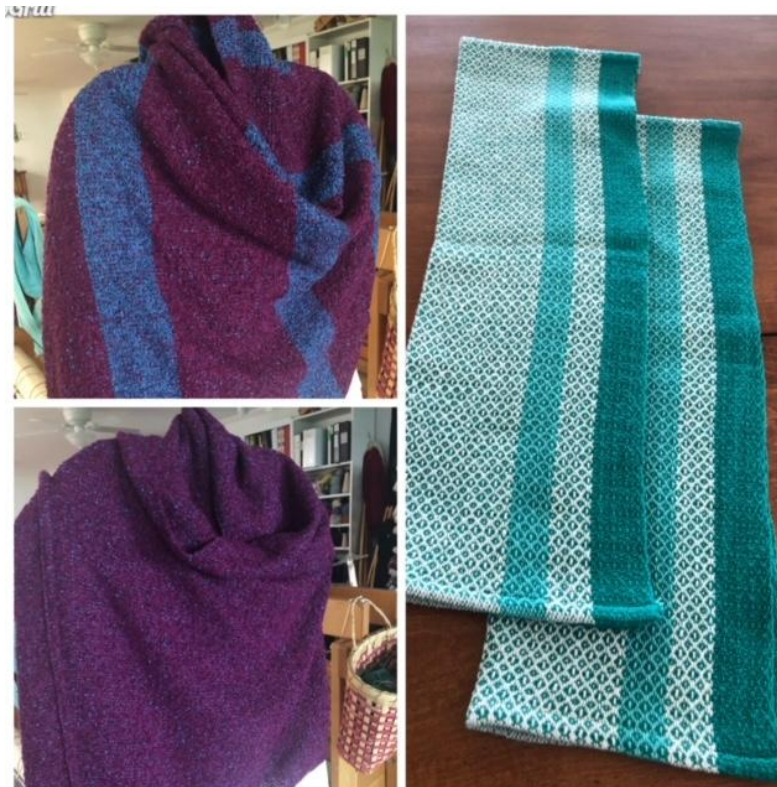
Hugs on the left; Towels on the right.