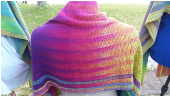
More of Rudell's Hugs!