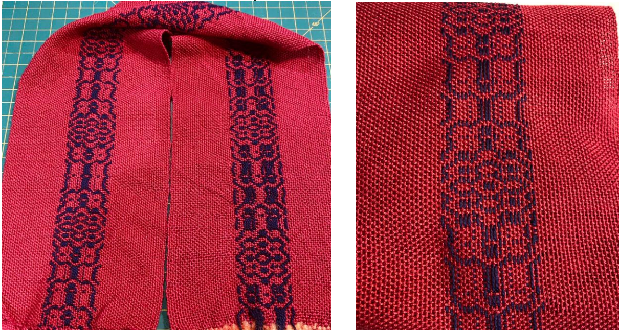
The picture on the left shows the whole sampler; on the right is a close-up.

Here is Elizabeth Bryan's red sampler in Overshot.