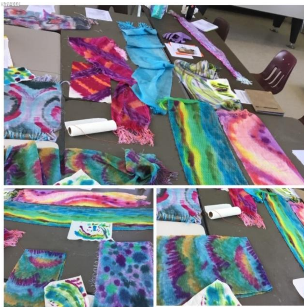
Scarves, scarves, and More Scarves!