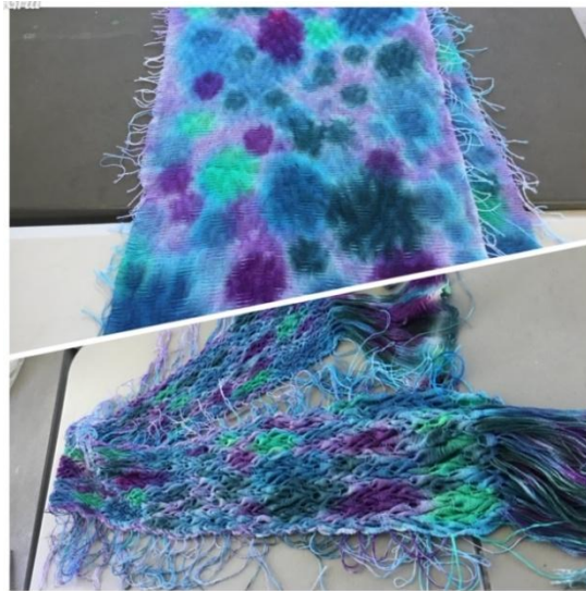
Top-Before Pulling Supplemental Warps Bottom-After Pulling