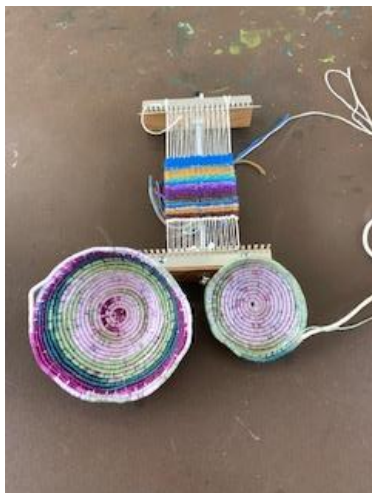
Jane's coiled baskets + tapestry.

Rudell wore most of her show and tell layered, as the day was a bit chilly!