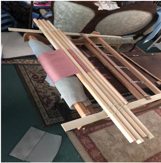
1970s Ashford rigid heddle loom warped with tensioning device.