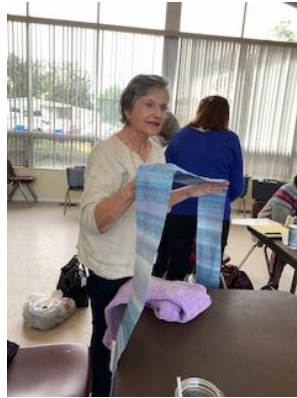
Kay's scarf and wrap.